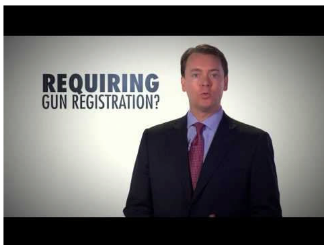
Ask Obama's Experts (NRAVideos)