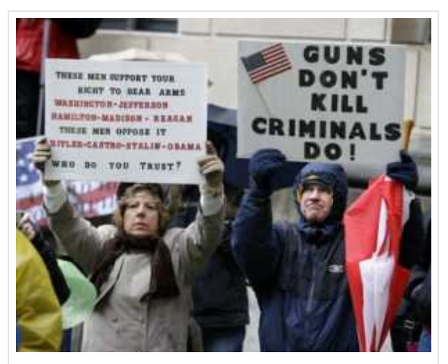
When guns aren't available for killing people, criminals just find another tool, according to a Harvard Study.

addition, England's most recent crime statistics have been grossly misrepresented. In 2006 the criminal justice system, in an attempt to conserve resources, initiated a policy in which the police would no longer investigate "minor" crimes, such as burglary and minor assault. If a mugger, robber, burglar or others engaged in minor criminal activities are caught, the police simply give them a warning – a virtual slap on the wrist – then send them on their way, without filing charges, arresting or prosecuting them. In other words, crime has not gone down in England, but rather "minor" crimes are simply no longer counted as crime.